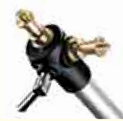
5/8" top fixing with 3/8" screw fixing (adjustable 90°) and 1/4" adapter for matching any requirement.