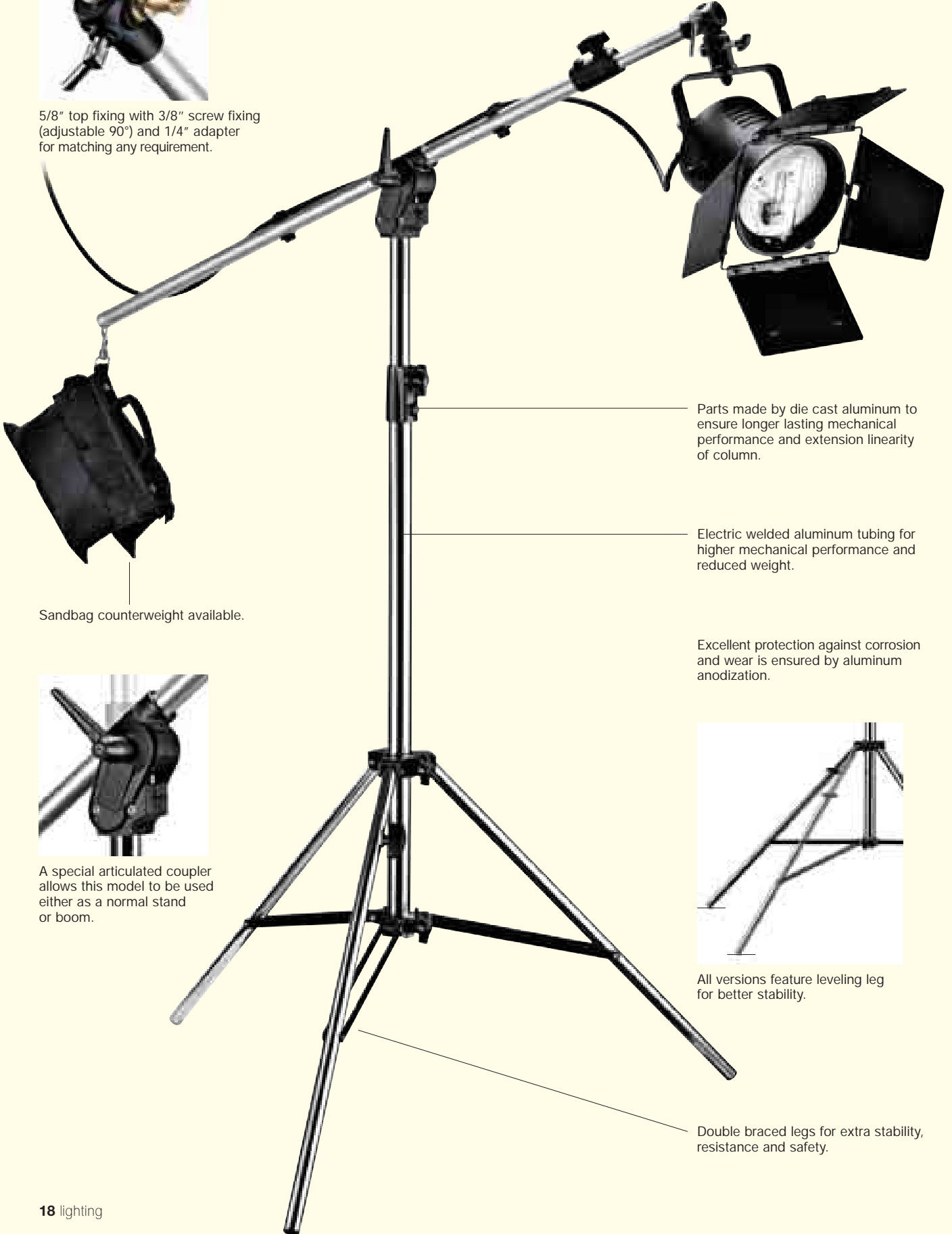
Sandbag counterweight available.